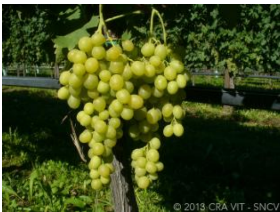
Fig. 1 – Bunches of cv Italia from the on-line Italian National Catalog of Grapevine Varieties.

Presently, Italia occupies about 40% of the Italian surface cultivated to table grape grapevine (Novello and de Palma, 2014). According to trials carried out in the Apulia region, Italia starts to be harvested from mid August and reaches notable carpological traits (Fig. 2), such as berry weight from about 9 up to 10-12 g and bunch weight from about 440 up to 1060 g (Novello et al. , 1999a; Novello et al. , 1999b).