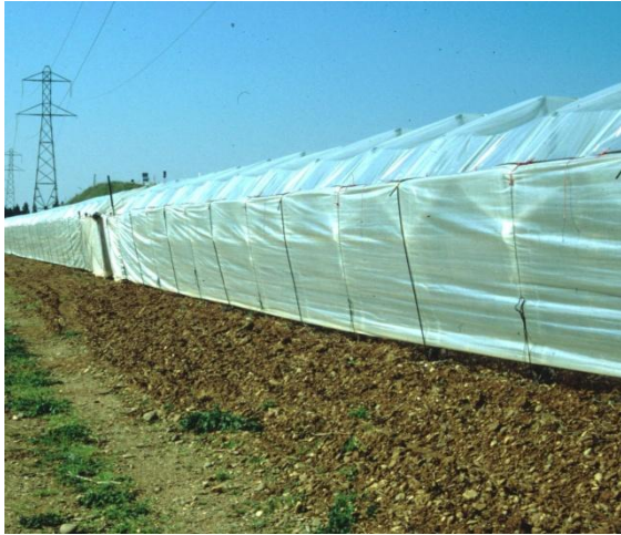
Fig. 3 – “Closed” plastic structure for “early covering” table grape vineyard (Apulia region, Southern Italy).