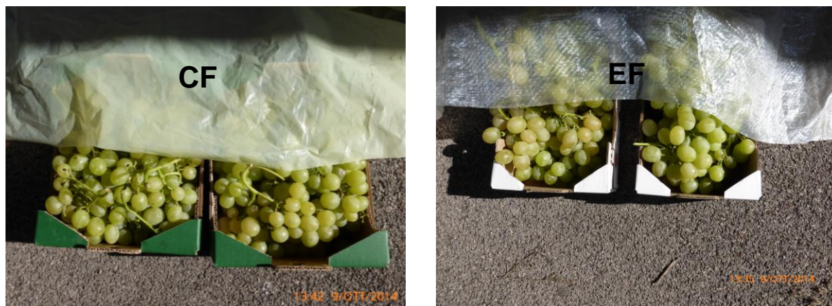
Fig. 7 – Grapes of cv Italia produced by “late covering” technique by using two types of plastic cover.

At farm harvest, CF and EF grapes looked very similar (fig 7).