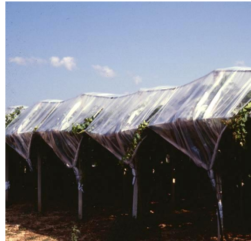
Fig. 4 – “Open” plastic structure for “late covering” table grape vineyard (Apulia region, Southern Italy).