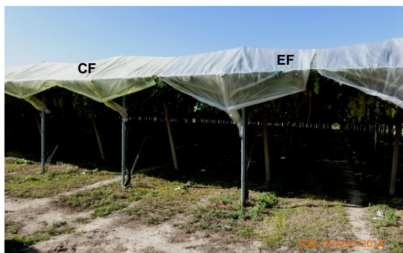
Fig. 5 – Late covering of cv Italia table grape vineyard at F.lli La Porta farm (Apulia region, Italy): adjacent rows covered with “commercial film” and “experimental film”.

At farm harvest, entire bunches were sampled in order to analyze several parameters useful to assess the grape quality.