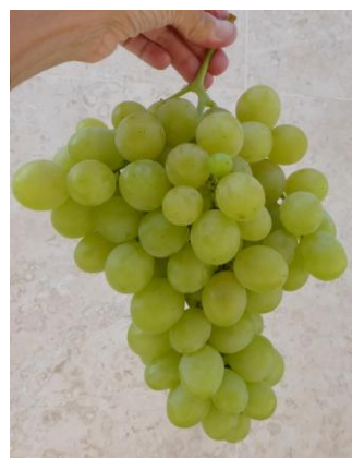
Fig. 2 – Bunch of cv Italia from a commercial vineyard of the Apulia region (Southern Italy, harvest 2014).