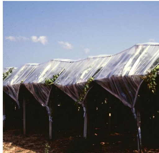
Fig. 4 – “Open” plastic structure for “late covering” table grape vineyard (Apulia region, Southern Italy).